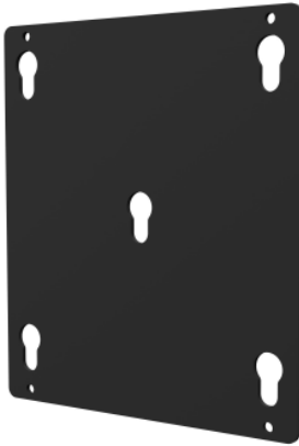
MS Audipack adapter plate.